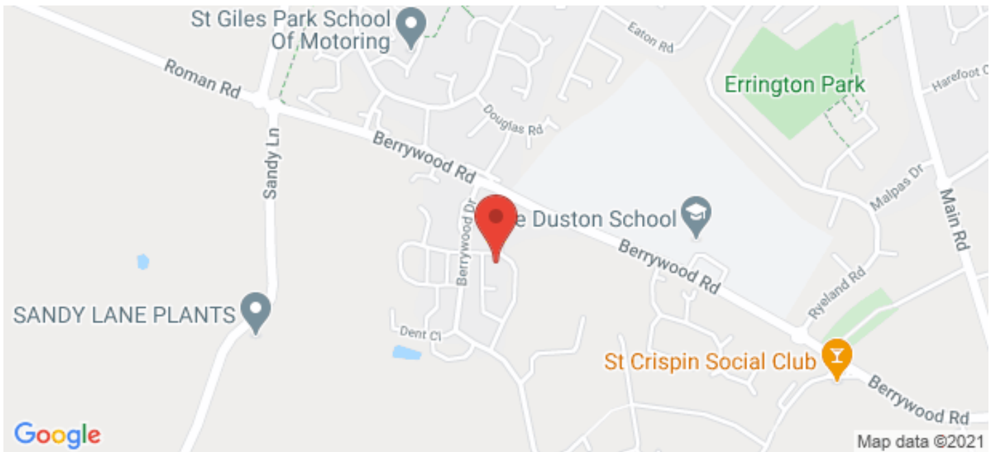
Roundwood Way, NN5