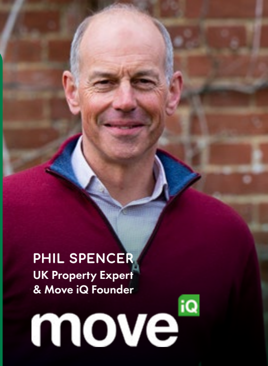
PHIL SPENCER UK Property Expert & Move iQ Founder

That's why choosing a Certified and Accredited Propertymark member is essential. As the professional body for estate agents, Propertymark ensures members are trained, audited, and bound by a strict code of conduct. This means fewer risks and greater confidence for you. Look for the Propertymark logo—the mark of professionalism and trust.