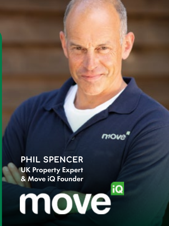
PHIL SPENCER UK Property Expert & Move iQ Founder

That’s why choosing a Certified and Accredited Propertymark member is essential. As the professional body for letting agents, Propertymark ensures members are trained, audited, and bound by a strict code of conduct. This means fewer risks and greater confidence for you. Look for the Propertymark logo—the mark of professionalism and trust.