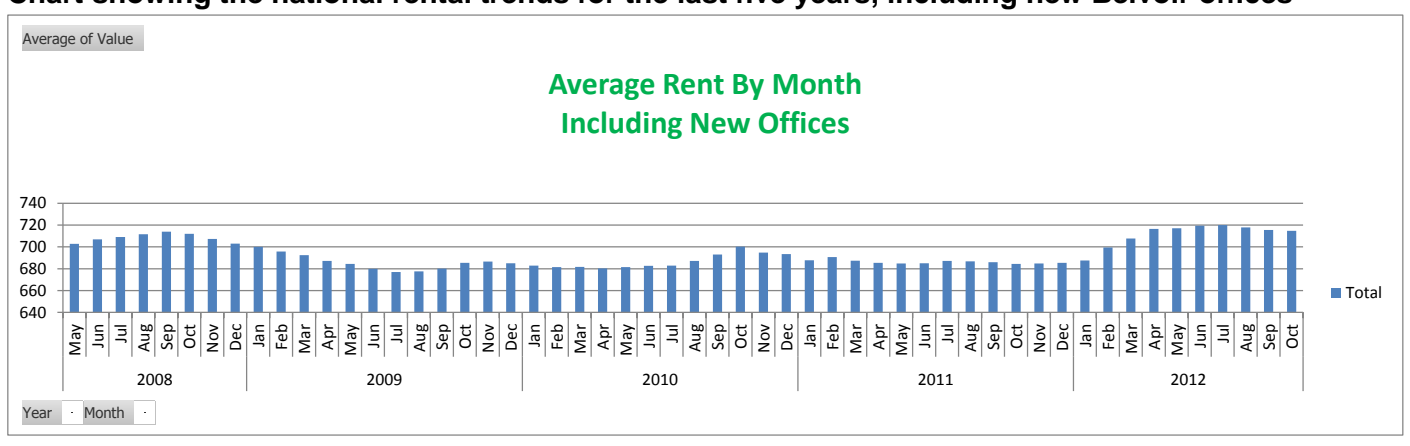
Chart showing the national rental trends for the last five years, including new Belvoir offices

During the last five years, Belvoir has added a number of offices to the Belvoir Group and the majority of these are now being tracked by our Index. Most of the new offices joined the Index at the start of the year, including Basildon, Hitchin and Leamington Spa. On average, these new offices' rents are approximately £750. As a result the chart below shows the addition of these new offices has boosted Belvoir's average monthly rents from around £680 for 2012 to £710 average rent per month. September's average was £716 per month and in October it was £715.