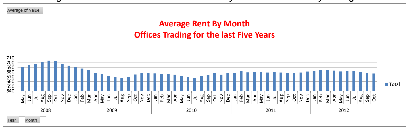
Chart showing the national rental trends for the last five years over consistently trading offices

During the last five years, Belvoir has added a number of offices to the Belvoir Group and the majority of these are now being tracked by our Index. Most of the new offices joined the Index at the start of the year, including Basildon, Hitchin and Leamington Spa. On average, these new offices' rents are approximately £750. As a result the chart below shows the addition of these new offices has boosted Belvoir's average monthly rents from around £680 for 2012 to £710 average rent per month. September's average was £716 per month and in October it was £715.